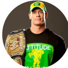
John Cena WRESTLER / ACTOR

NMLS 2289981 682.321.3420 zfix@altahl.com mrfixyourloan.com 3216 Napier Park Dr. Ste 208 San Antonio, TX 78231